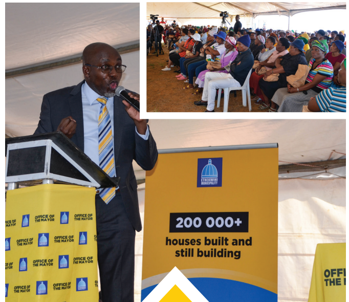
The community welcomed the launch of the R52 million uMbhayi Housing Project by eThekweni Mayor Councillor Mxolisi Kaunda.

“Also, our targeted drive to eradicate transit camps by 2026 has seen 300 families from the Isiphingo Transit Camp relocate to the newly built Kanku Road Housing Project. To give security of tenure, more than 500 title deeds were issued last year giving property and home ownership to the poor,” concluded Mayor Kaunda.