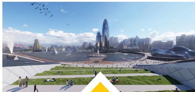
A view of the proposed concert venue with a City backdrop. This is part of the proposed Durban Bay Marina development in eThekweni.

Of special focus was the development of the Durban