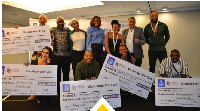
The City's Durban Film Office awarded over R1.5 million to five beneficiaries of its Micro Budget Film and Development Fund Programmes recently.

"This allows filmmakers to focus on bringing their