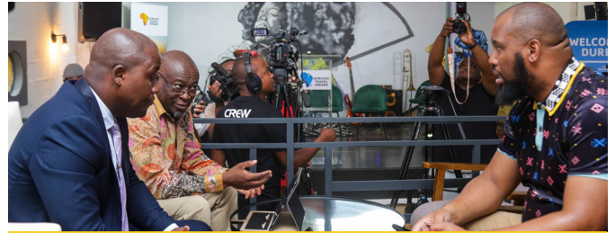
The renowned Africa Travel Indaba takes place in the City from 13 to 16 May. The event was launched recently by Deputy Minister of Tourism Fish Mahlalela, together with the MEC for Economic Development, Tourism and Environmental Affairs in KwaZulu-Natal Siboniso Duma, and Chairperson of the Economic Development and Planning Committee Councillor Thembo Ntuli.

Councillor Ntuli said: “The City’s economy will benefit immensely from hosting this four-day event. Hotel occupancy is expected to be between 85 and 95 percent. The total expected spending is estimated at R177 million, contributing R439 million to eThekweni’s GDP with 796 jobs to be created.”