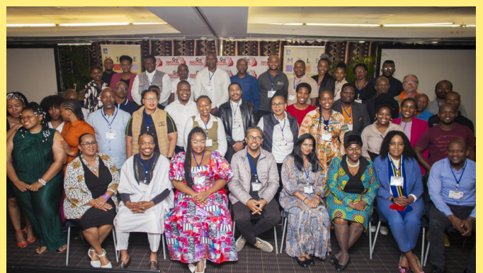
A meeting of minds. Delegates at the BRICS+SDATI Manufacturing Group Information Session.