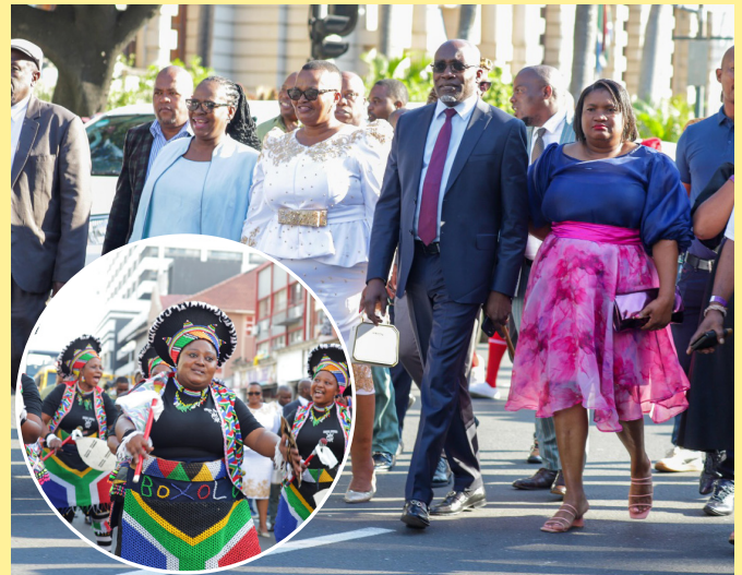
A lively street parade celebrated the City’s cultural diversity. This preceded eThekweni Mayor Councillor Mxolisi Kaunda’s State of the City address at the Inkosi Albert Luthuli International Convention Centre.

robust recovery in key sectors such as transport, finance, and construction, driven by our Economic Recovery Plan. Our tourism sector is on a rebound and the visitor numbers have returned to pre-COVID-19 levels,” said Mayor Kaunda. “As the leadership of the City, we remain committed