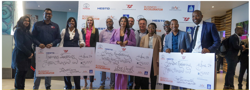
The City's Economic Development Unit awarded the Durban Automotive Cluster business accelerator SMEs cheques worth R55 000 to help support and grow their businesses.

The accelerator programme aligns with eThekweni's