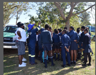
A community event at Inanda Wilderness Park brought together community members, schools, stewardship organisations, and traditional healers as part of eThekweni Enviro Week celebrations.

Green Corridors continues to build partnerships with local businesses and corporations to improve river and ocean health, striving to restore the Blue Flag status of regional beaches.