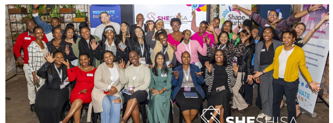
Innovate Durban launched the Women in Business Accelerator programme, SHESHisa which empowers female entrepreneurs.

This approach ensures that the entrepreneurs who would benefit most from the programme's support are those who have yet to receive similar opportunities. Additionally, the selection criteria focused on the nature of the businesses, favouring those with tangible products