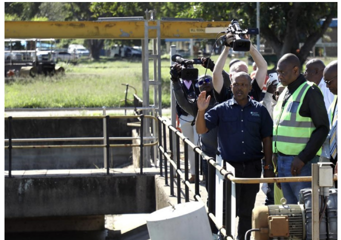
Deputy President Paul Mashatile and eThekweni Mayor Councillor Mxolisi Kaunda took stock of progress made to repair damaged water and sanitation infrastructure in the City.

commenced with construction of the Southern Aqueduct Pipeline to uMlazi and surrounding communities in the south of Durban.