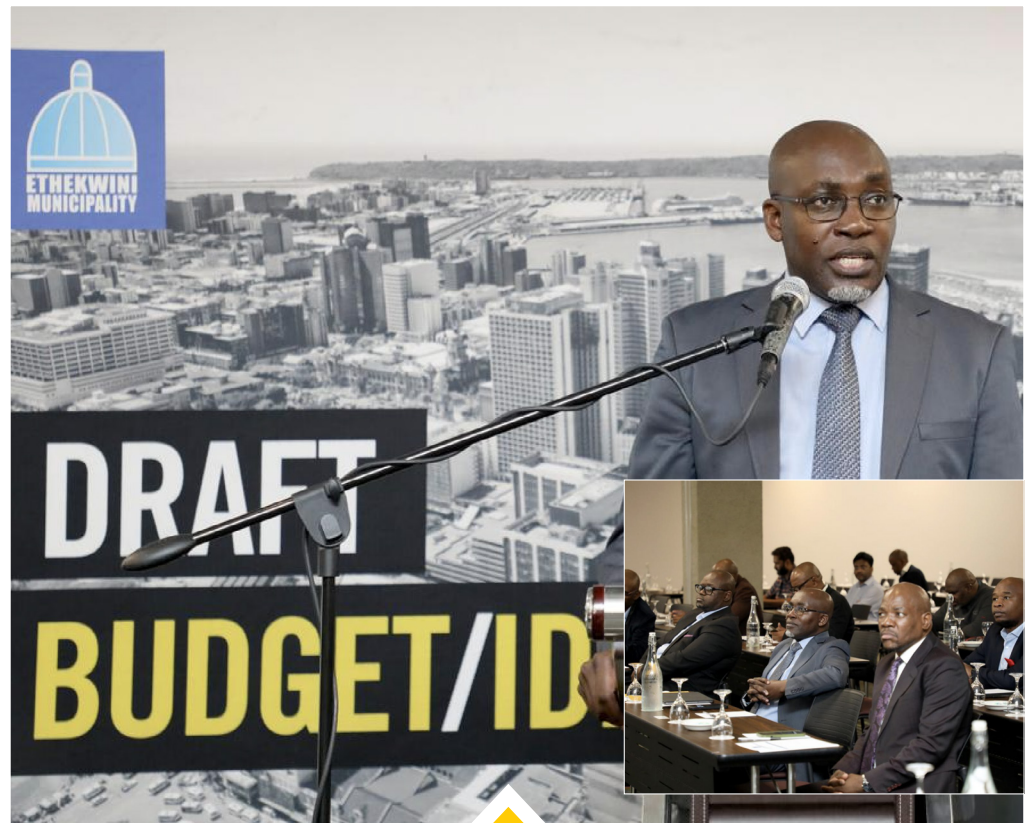
EThekweni Mayor Councillor Mxolisi Kaunda and other senior City leadership met with the business community, as a vital stakeholder of the City, to unpack the 2024/25 draft budget and Integrated Development Plan.

Highlighting the progress achieved in water and sanitation services, officials lauded the implementation of a turnaround strategy, which has yielded tangible results such as the reduction of non-revenue