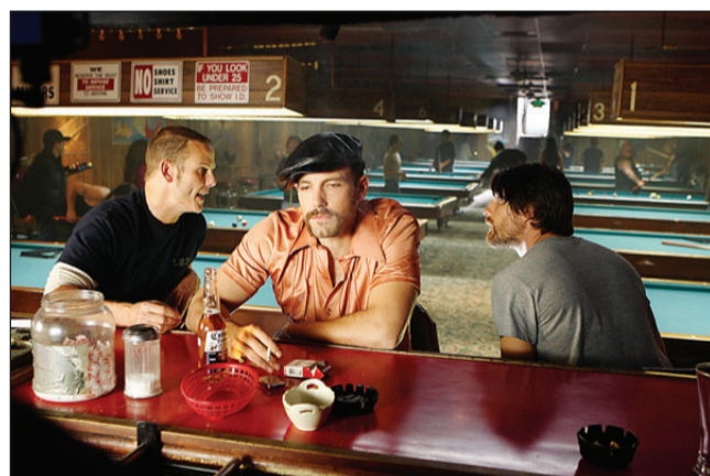
CRIME CAPER: Peter Berg as 'Pistol' Pete Deeks, Ben Affleck as Jack Dupree, and Jason Bateman as Rupert Rip Reed in a scene from Smoking Aces

Durban Motor Show Durban Exhibition Centre Until 25 March